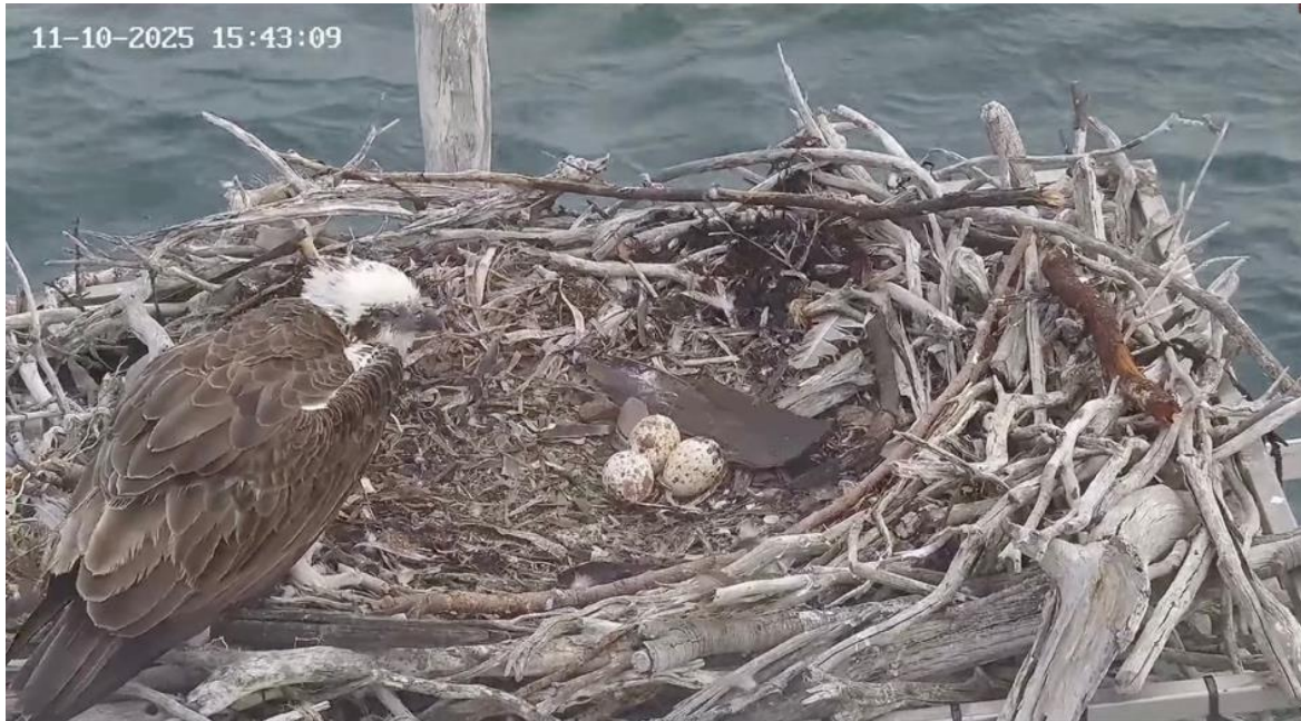
Image 1 Port Lincoln barge osprey nest camera

On the Port Lincoln Barge the female stopped incubating her eggs and after several days the eggs were removed and sent to a laboratory for testing. They were found to have non-viable foetus with two being almost fully developed. It is not known what caused her to stop incubating. A new platform near Point Pearce was looking hopeful but disturbance from vehicles on the beach seem to have resulted in a failure at that nest this season.