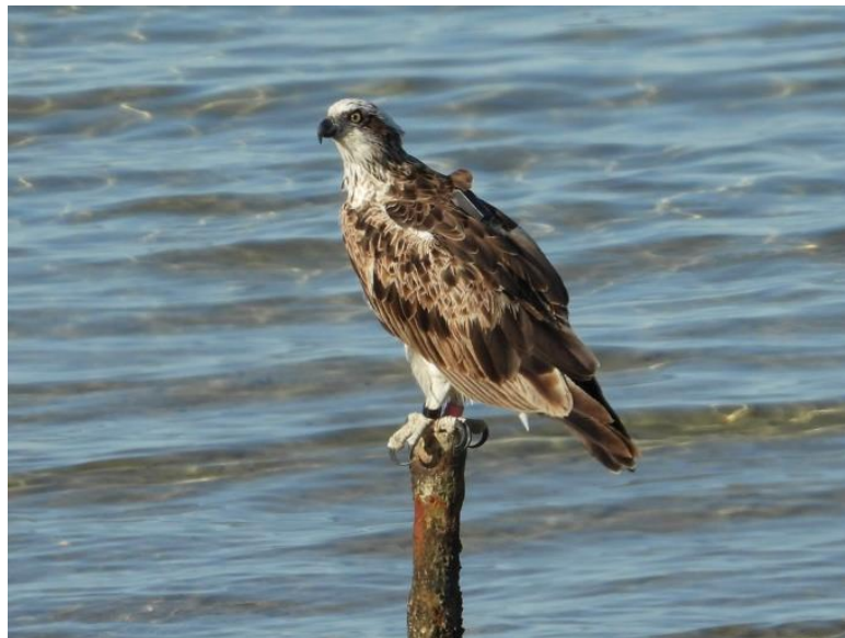
Image 2 Osprey (Annie) resting near Point Turton - Photo by Nanou Carbourdin

Colour bands fitted to birds, while not as effective as an active tracker, are a useful means of identifying bird movements. Recently one of the 2021 birds banded at Price was reported at Bird Island, Outer Harbour, in company with another unbanded Osprey. Regular reports are also received for Bradley (Port Lincoln 2023) at the Tod River, Libby (Coobowie 2024) at Point Turton, Phantom (Price 2021) at various locations on Kangaroo Island and Calypso (Port Lincoln 2019) has been resident on the Platform funded by Birds SA at Tulka since it was installed in 2024. Details of band colours are available on the Friends of Osprey Facebook page .